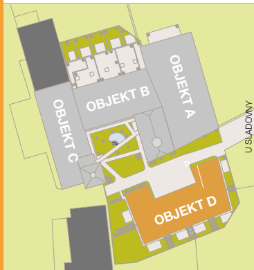
BYT D 305